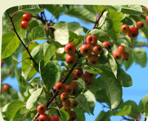
Crab apple Malus sylvestris