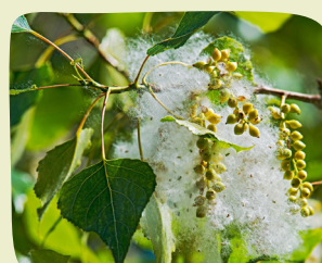
Black poplar Populus nigra subsp. betulifolia