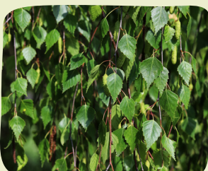
Silver birch Betula pendula