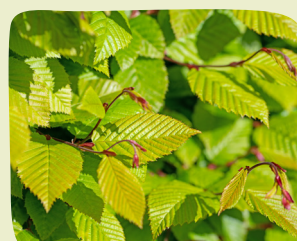
Hornbeam Carpinus betulus