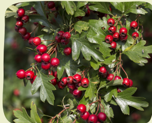
Hawthorn Crataegus monogyna