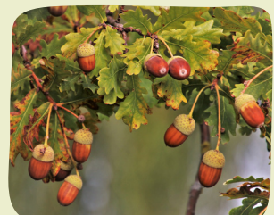
English oak Quercus robur