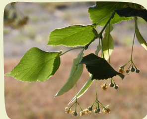
Large-leaved lime Tilia platyphyllos