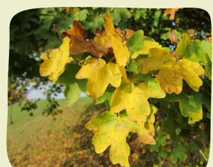
Field maple Acer camprestre