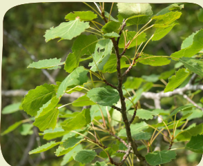
Aspen Populus tremula