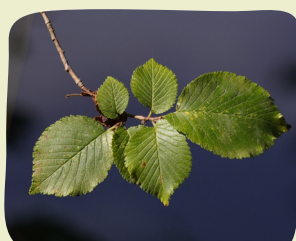
English elm Ulmus procera