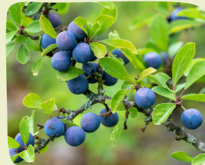
Blackthorn Prunus spinosa