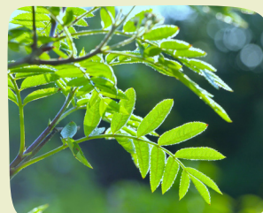
Ash Fraxinus excelsior