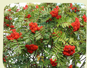
Rowan Sorbus aucuparia