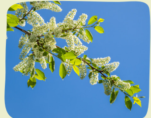
Bird cherry Prunus padus