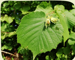
Hazel Corylus avellana

Can you find any of these trees in your local area?